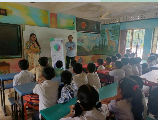
Pre-Launch Engagement Session in Progress — Moddho Tahirpur Government Primary School.

During the pre-monsoon period, farmers venture into open fields to harvest crops — activities that coincide with intense electrical storms, putting them at heightened risk of lightning strike. As the monsoon advances, fishermen take to the open water in large numbers during storms, facing both flash flood-induced drowning and lightning hazards simultaneously. Children are disproportionately affected, as seasonal flooding creates persistent drowning risks. These deaths are, in large part, avoidable — and it is this recognition that motivates the establishment of a community Case Station in the area.