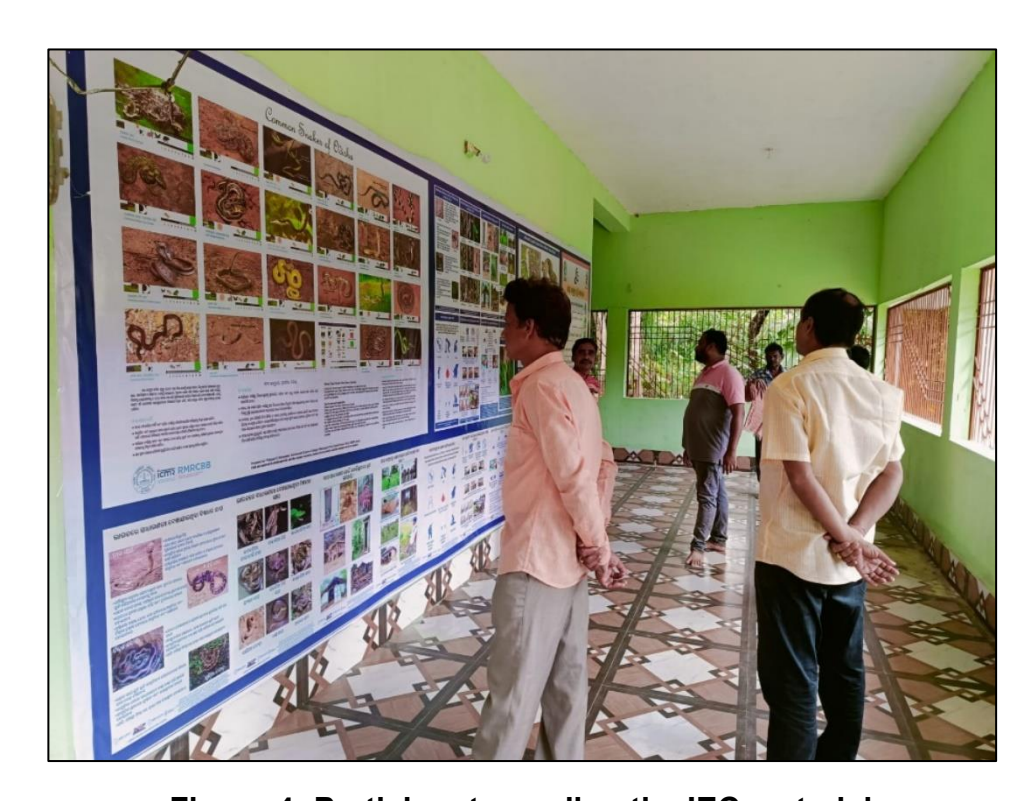
Figure 4: Participants reading the IEC material

Prior to the inauguration, participants celebrated the local festival of Ganesh Puja and read the Oriya poster display of information and education (IEC) materials on the prevention of avoidable snakebite deaths.