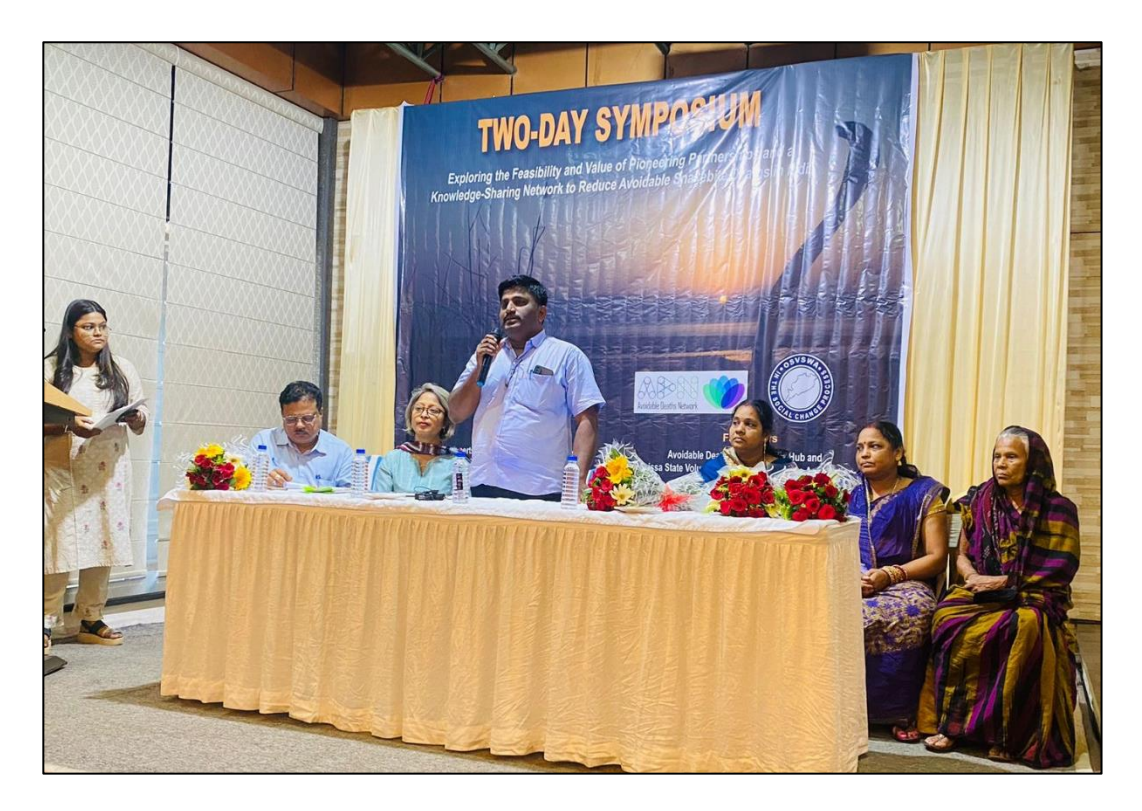
Figure 1: Speakers from Ganjam district participating in the Avoidable Snakebite Deaths project

Through the Leicester Institute for Advanced Studies and Institute for Environmental Futures-funded project <u>Exploring the Feasibility and Value of Pioneering Partnerships to Reduce Avoidable Snakebite Deaths in India</u>, the ADN India Hub identified that the village of Burujhari in the Kodala Tehsil of Ganjam district, is home to the highest number of snakebites in Odisha due to its proximity to coastal jungles, the warm and humid climate and high population density.