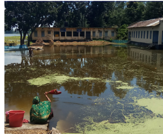
FIGURE 2: THE START OF THE MONSOON SEASON AT DAULATPUR UNION HEALTH AND FAMILY WELFARE CENTER IN JULY 2016

It is recommended that the Ministry of Health and Family Welfare promote interventions, such as the RHCC and the Minimum Initial Service Package (MISP), in order to prepare the primary health care for floods, cyclones or other crises.